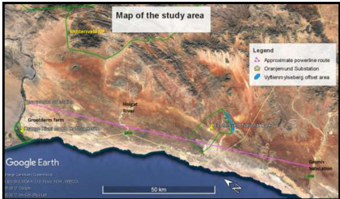
Figure 1: Locality map, showing various key features referred to in this report.