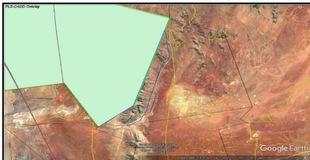
Figure 2: The area outlined in blue is the proposed Vyftienmyl se Berg offset area, being adjacent to the area already within the Richtersveld National Park (Klein Duin section; green shading).