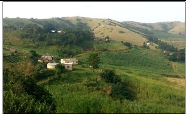
Figure 9: Rural landscape south of the Ongoye Forest within Corridor Alternative 1. The landscape consists of alternating transformed areas associated with homesteads and intact grasslands or forest patches