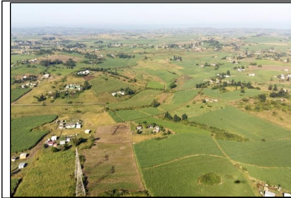
Figure 8: Intensively developed landscape north of the Thukela River along Corridor 2, showing the existing Eskom power line as well as the mix of sugarcane and homesteads